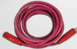
■ 25 FOOT RED EXTENSION CABLE A500010