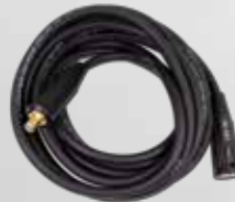
■ 25 FOOT BLACK EXTENSION CABLE A500011