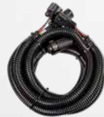
■ 10 FOOT REMOTE WELDING CONTROL EXTENSION CABLE A500028