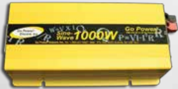
■ 1000W, 12V INVERTER A500172