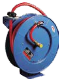
HOSE REEL, 1/2" X 50 FT A700007