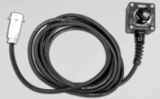
■ 15 FOOT CURRENT CONTROL PENDANT A500018