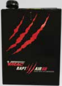
■ 7 GALLON DIESEL TANK A500013