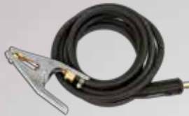
■ 15 FOOT GROUND WELDING CABLE A500009