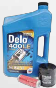
100 HOUR KUBOTA ENGINE SERVICE KIT A500007