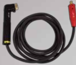
■ 15 FOOT ELECTRODE WELDING CABLE A500008