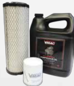
200 HOUR COMPRESSOR SERVICE KIT A500023