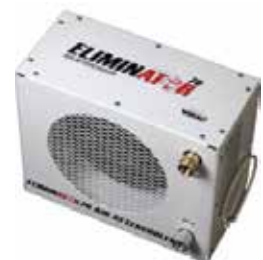
ELIMINATOR70 AIR AFTERCOOLER A800070