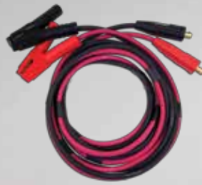
■ 15 FOOT BOOSTER CABLE SET A500016