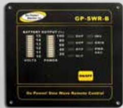
■ REMOTE FOR 1000W, 12V INVERTER A500173