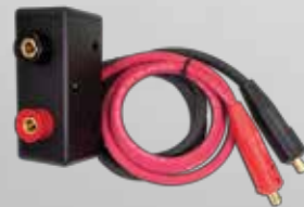
■ 6 FOOT DC EXTENSION CABLE A500012