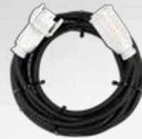
■ 25 FOOT CURRENT CONTROL EXTENSION CABLE A500019