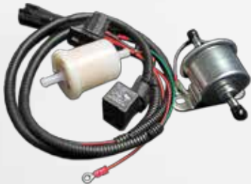
■ TRANSFER FUEL PUMP KIT A500030