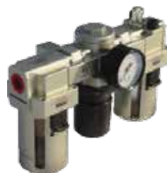
FILTER REGULATOR LUBRICATOR, 3/4" A700151