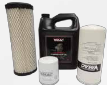
400 HOUR COMPRESSOR SERVICE KIT A500024